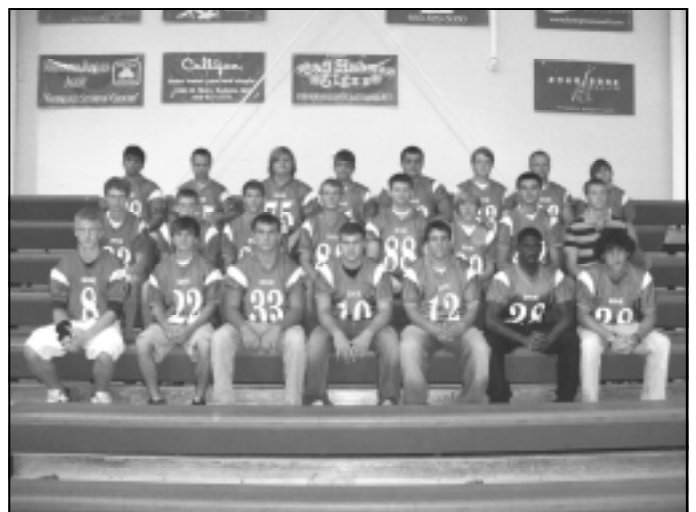
2010-2011 Football Team