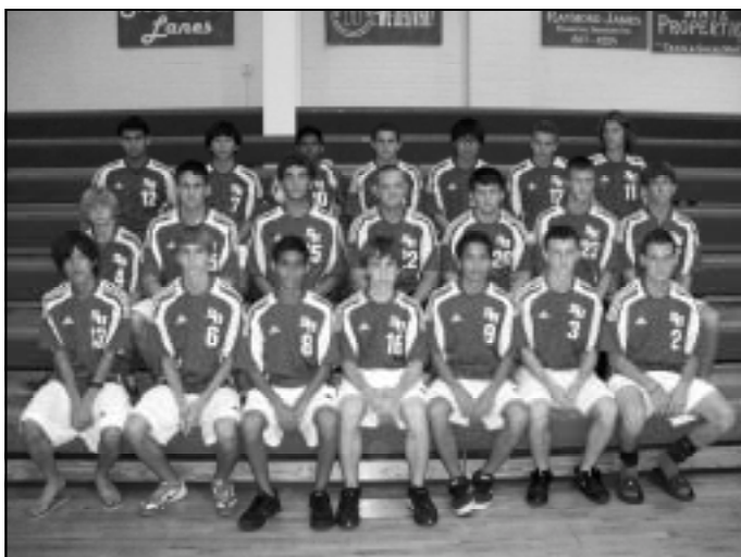
2010-2011 Varsity Soccer Team