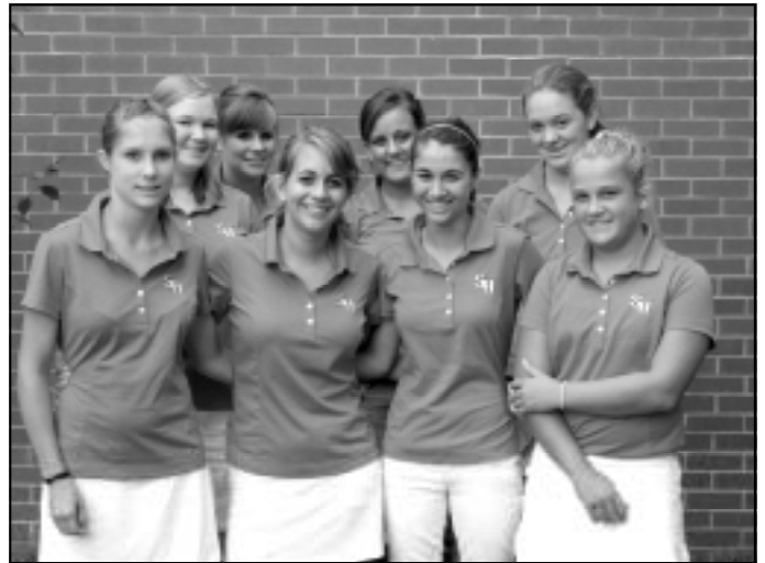
2010-2011 Girl Golf Team