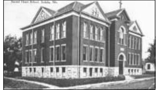
Sacred Heart School 1907