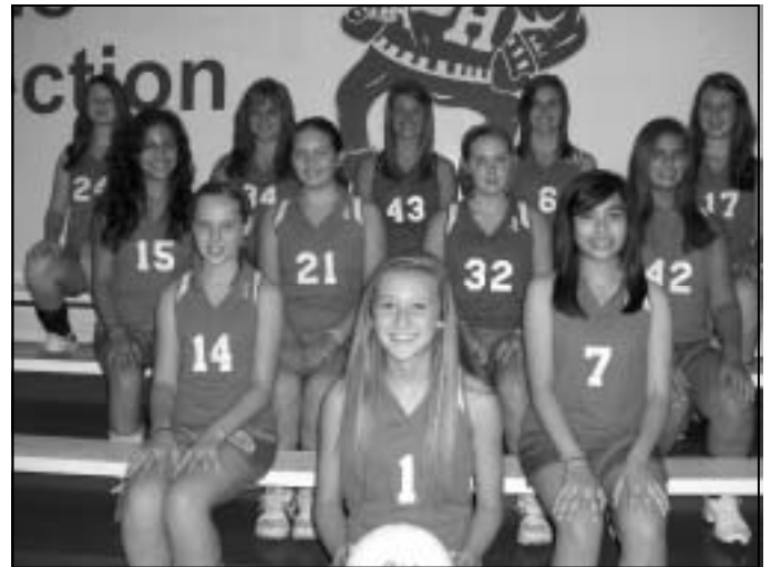
2010-2011 Junior High Volleyball Team