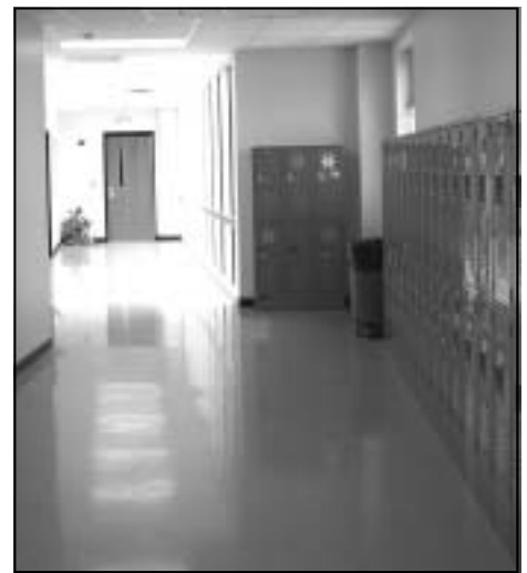
View of the second floor hallway which shows the lockers utilized by the 5th grade classes.