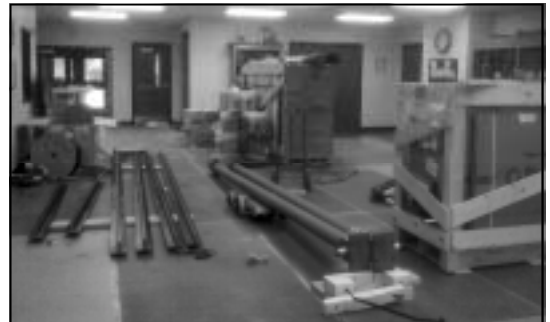
The installation of the elevator has made the upper floors of the school handicap accessible for the first time in it's history.

We could never begin to adequately thank all of the people who made so many significant and meaningful contributions of time, talent and